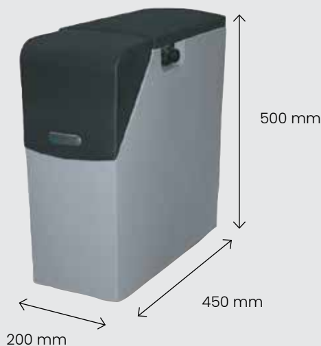
Art. number: 28145