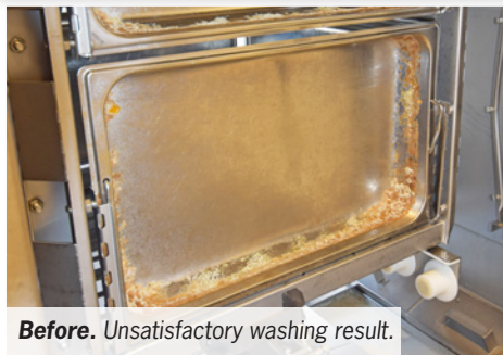
Before. Unsatisfactory washing result.