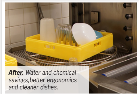
After. Water and chemical savings, better ergonomics and cleaner dishes.