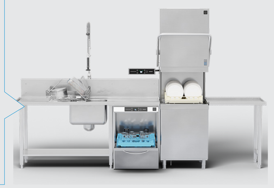
W 3335 mm D 745/785 1 mm H 1950/2125 2 mm

Higher productivity and better flexibility in less time.